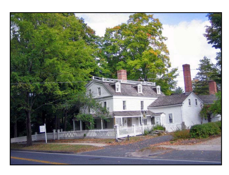
Cannonball House, Cass Gilbert's country house in Ridgefield, Connecticut

Admission is free to Society members. There is a $5.00 charge for nonmembers. Refreshments will be served after the presentation.