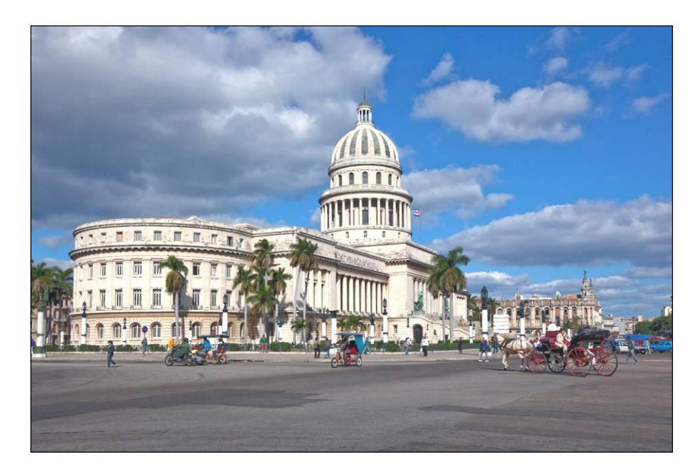
El Capitolio in Havana, Cuba.