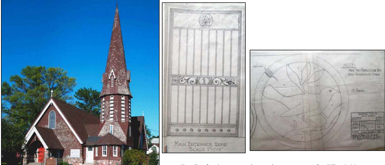
Episcopal Church of St. John the Divine, Moorhead, Minnesota