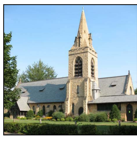
St. Clement's Church